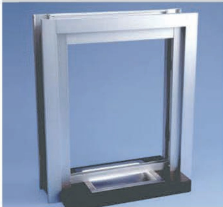
FIXED STAINLESS STEEL WINDOW