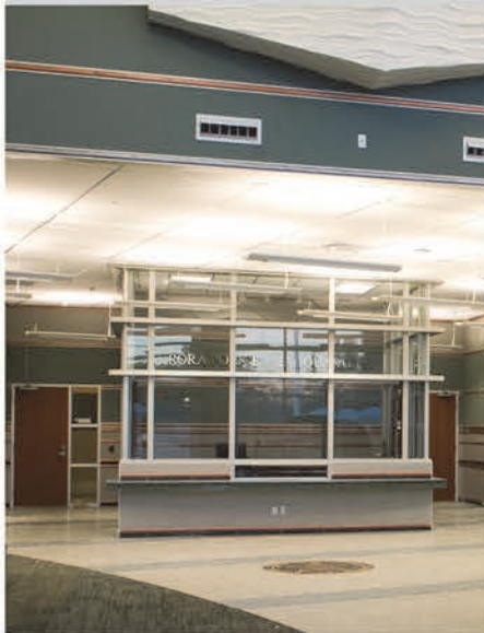
METAL PACKAGE RECEIVERS