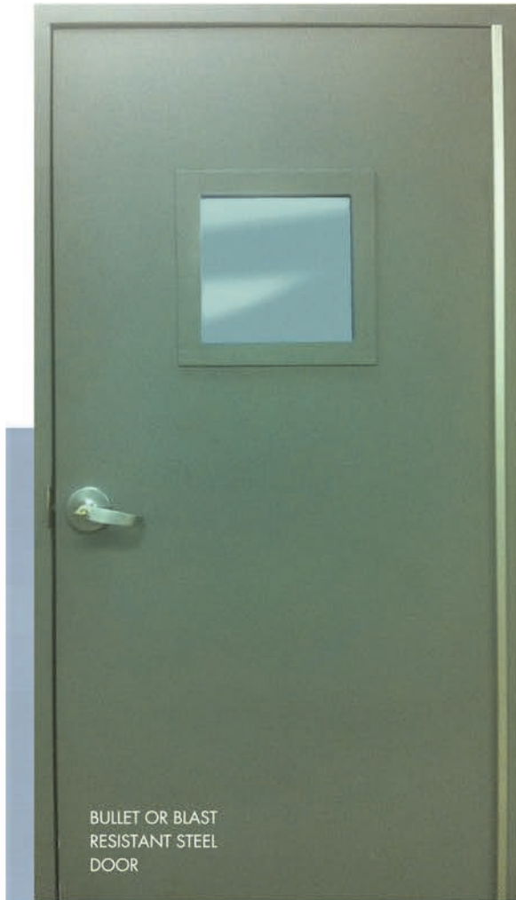
BULLET OR BLAST RESISTANT STEEL DOOR