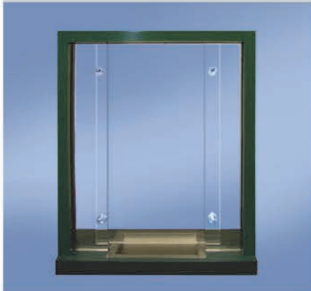
BAFFLE TRANSACTION WINDOW