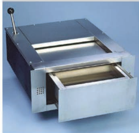
BULLET RESISTANT TRANSACTION DRAWERS