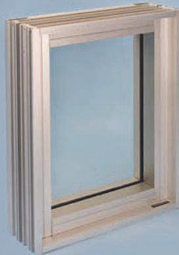
625 ALUMINUM BULLET/BLAST FIXED WINDOW