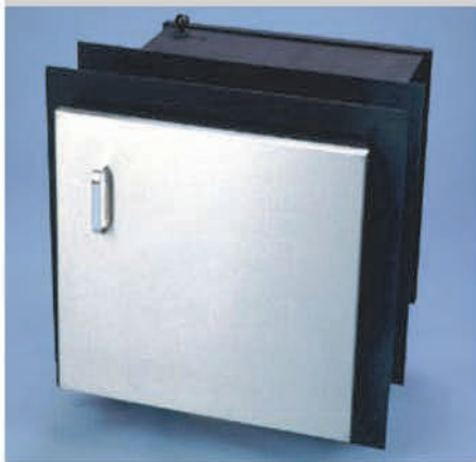
METAL PACKAGE RECEIVERS